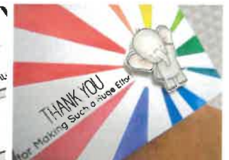
Ayva- Origami task