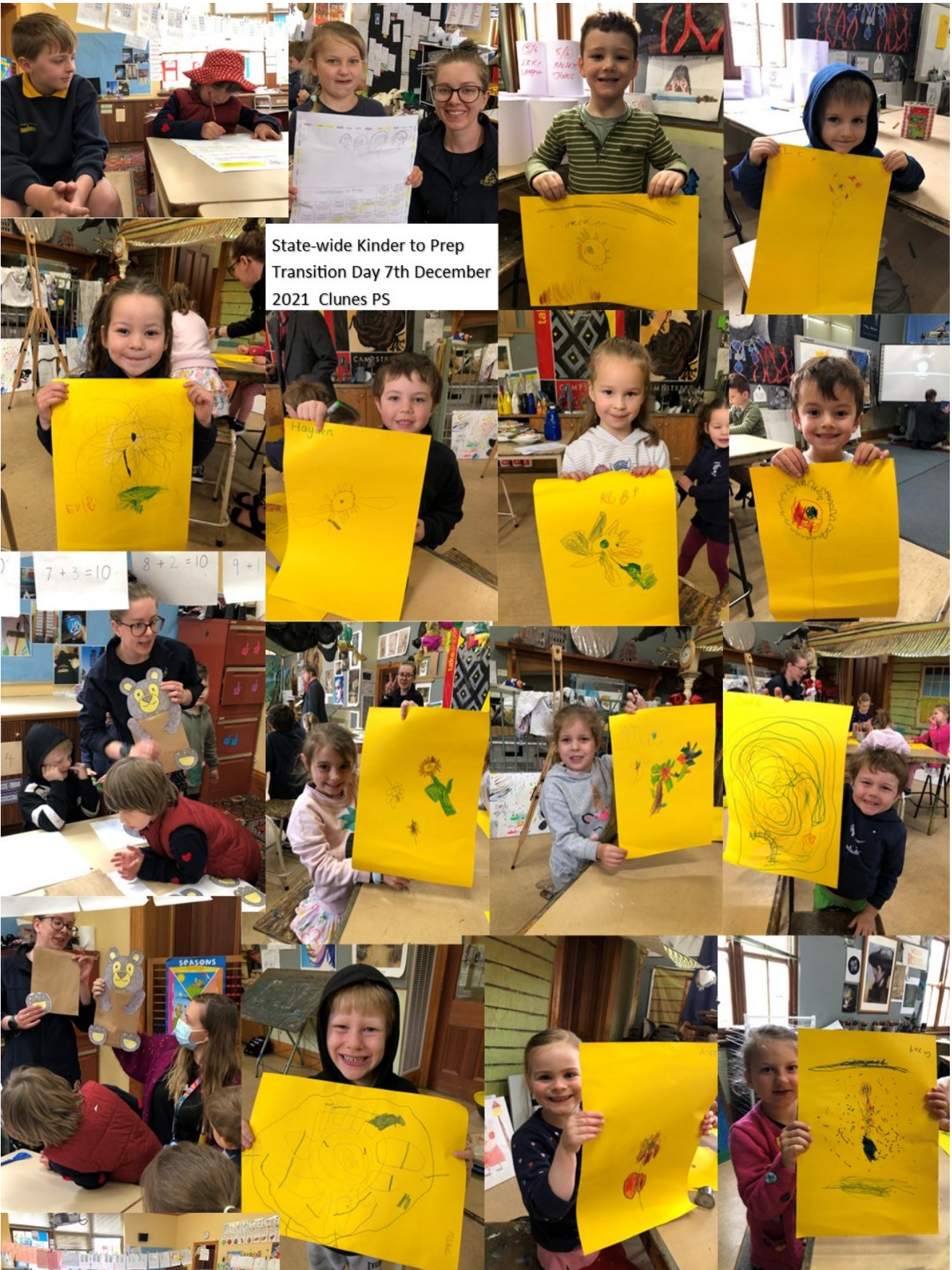
State-wide Kinder to Prep Transition Day 7th December 2021 Clunes PS