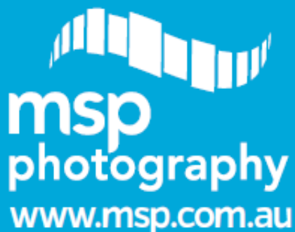
PHOTO DAY IS COMING ....