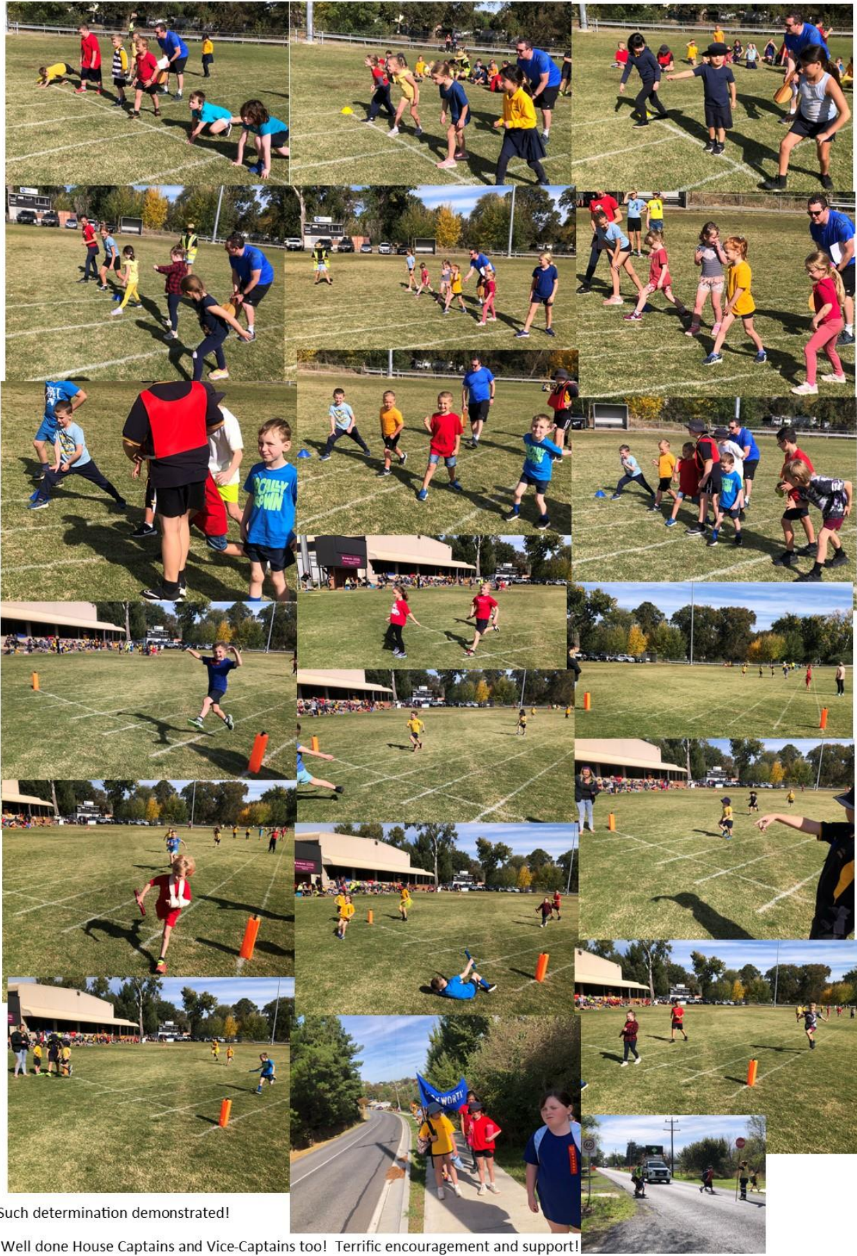
Such determination demonstrated!