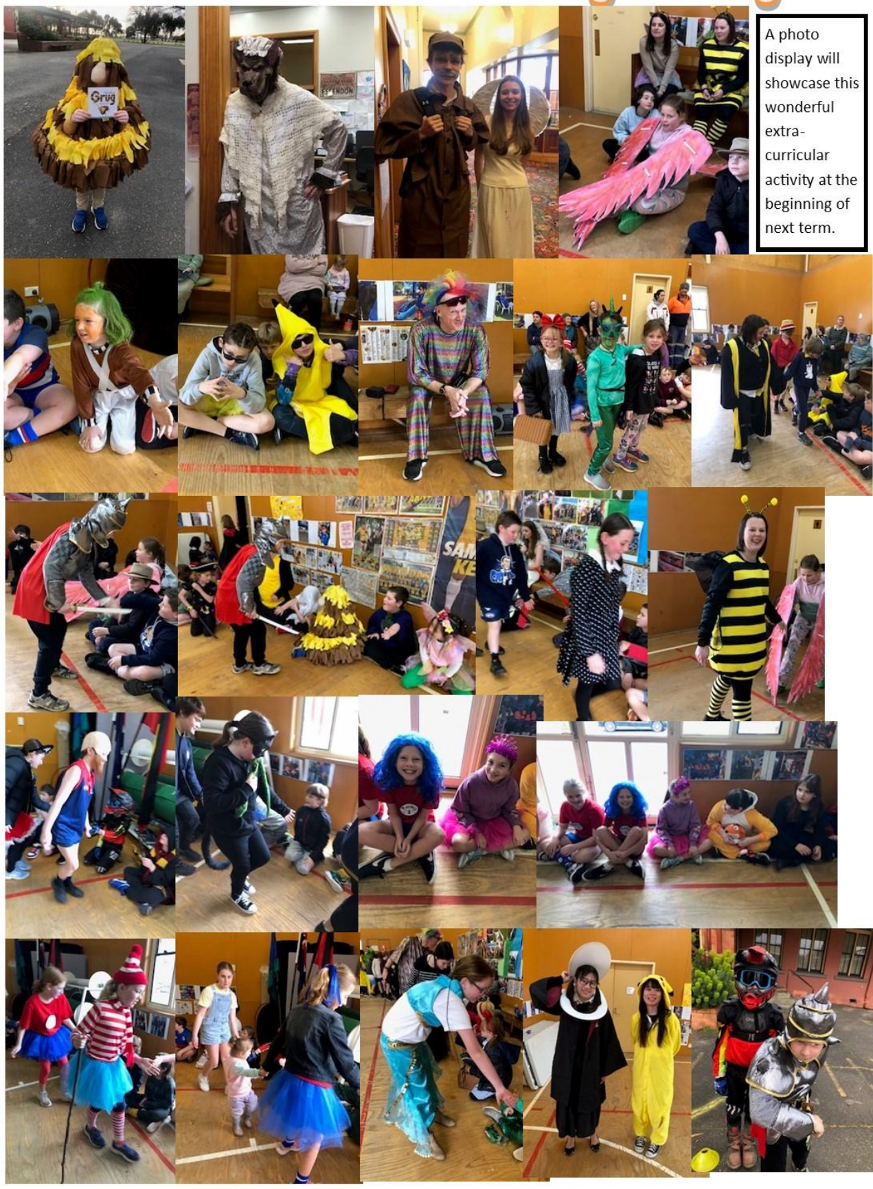
A photo display will showcase this wonderful extra-curricular activity at the beginning of next term.