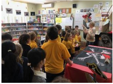
1 / 2MJ browsing before the Book Fair!