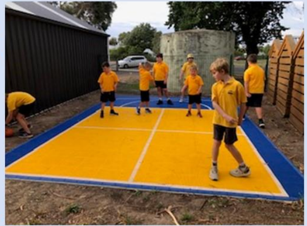
Active use before, during and after school