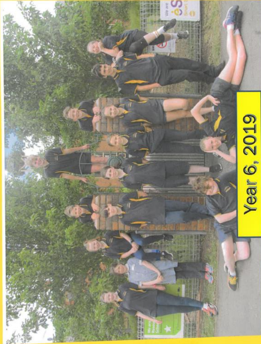
Year 6, 2019